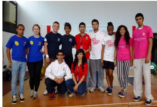
Trip to Paris to watch the world championships in 2011