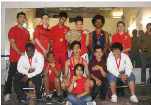
Second Annual club Competition in Perivale track