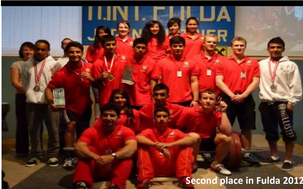
Second place in Fulda 2012